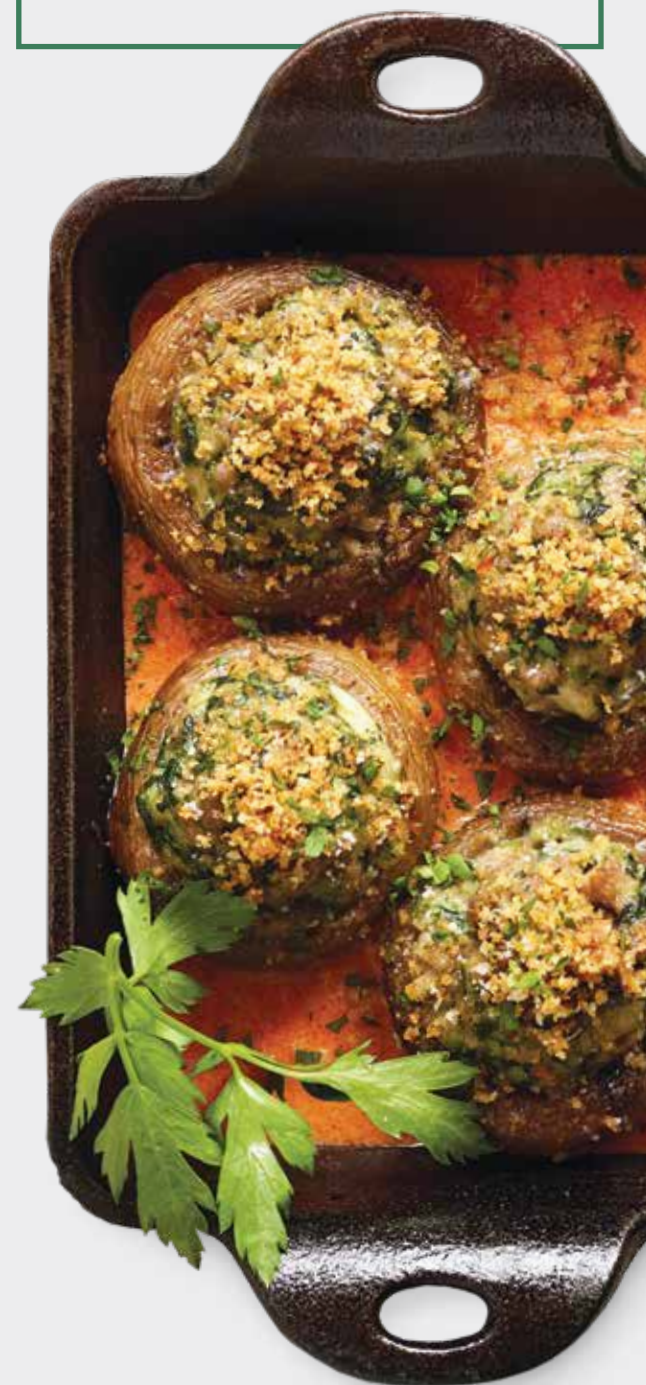
THREE-CHEESE & SAUSAGE STUFFED MUSHROOMS

THREE-CHEESE & SAUSAGE STUFFED MUSHROOMS Stuffed with sausage, spinach, ricotta, romano, mozzarella and Italian breadcrumbs served over our tomato cream sauce (300 calories) | 6.49